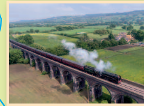
Stanway Viaduct 15 arches, 42 feet above the valley floor

It passes through a 693 yard tunnel at Greet and over a 15 arch viaduct at Stanway.